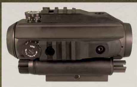
p/n ATOS3.0B2 'Marksman' Model

Eye Relief 66mm Field of View 6 degrees Exit Pupil 8mm Fixed Focus Range 20m to infinity Battery Type CR 123 (3v Lithium) Battery Life 3.1 years average Exterior Finish Black anodized aluminum