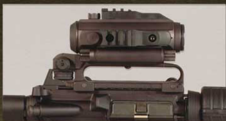
p/n ATOS3.0A with Handle Mount

Magnification 3.1x nominal Length 135mm nominal Width 65mm nominal with bumpers Height 77mm nominal with bumpers Weight 415g nominal Illumination source Battery-powered LED Illumination settings 11 visible, 3 night vision Reticle Dual-thickness crosshair with Rapid Aiming Feature and range finder