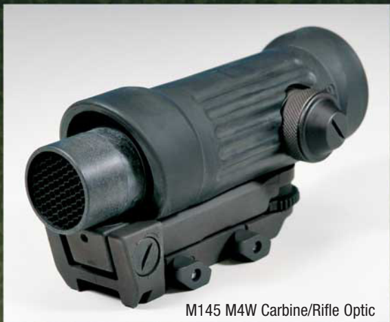
M145 M4W Carbine/Rifle Optic