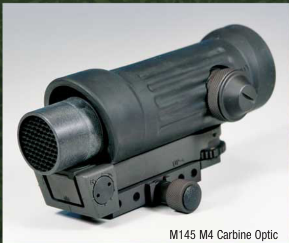
M145 M4 Carbine Optic