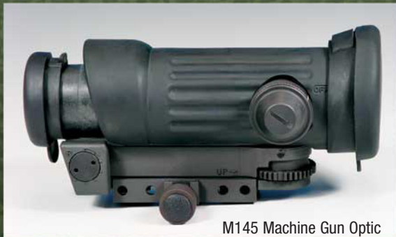
M145 Machine Gun Optic